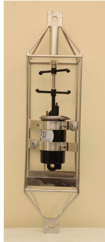
ACM-PLUS-200 shown with Integrated CTD and 5 Ton Frame Options