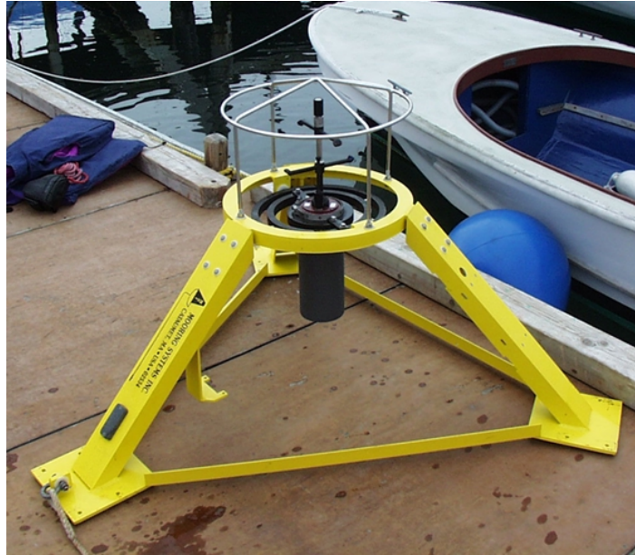
Figure 2 – 3D-ACM Wave/Current Meter

acoustic paths. These paths are defined by transducers installed on the ends of orthogonally arranged “fingers” shown in Figure 2 below. The phase shifts measured by the forward and reverse readings along these acoustic paths are used to resolve the three components of velocity (X, Y, Z). Readings along one of the acoustic paths will be contaminated by the wake from the center support strut; data from this path is not used in the velocity calculation. Since only three axes are required for a complete solution of the X, Y, and Z components of velocity, the meter provides an accurate determination of current flow without contamination by flow interaction with the center strut.