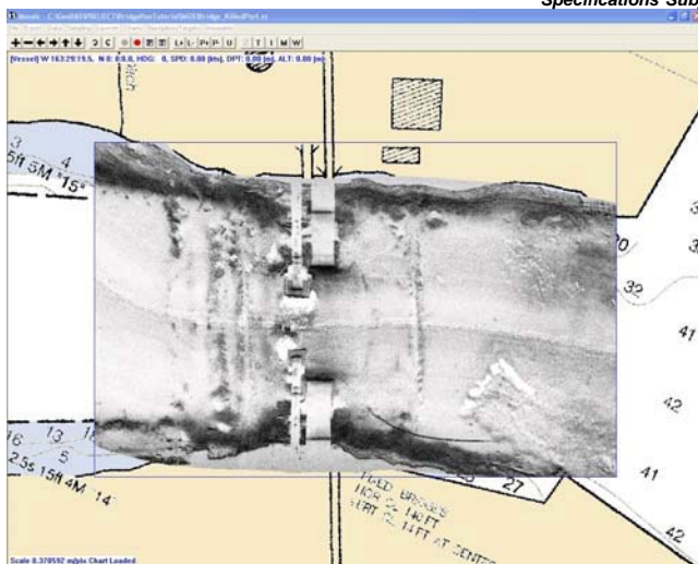
HMS-1400 sidescan image indicating bridge scour

Specifications Subject to Change without Notice