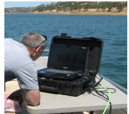
Portable, powerful, and easy to use.