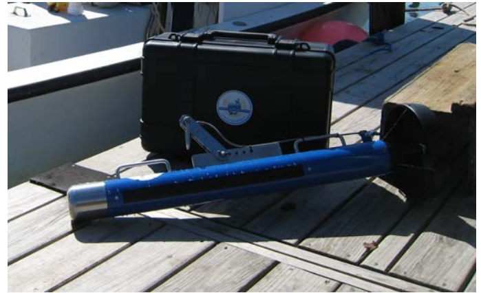
The HMS-1400 Sidescan Sonar System

The HMS-1400 System combines a portable digital sidescan towfish and sonar interface with true 16-bit processing in a Toughbox workstation with GeoDAS software for high-resolution survey imaging. Easy-to-use and low-cost, the HMS-1400 System provides single- or dual-frequency operation with depth, heading, and attitude sensors. The powerful GeoDAS software offers an extensive suite of capabilities common in more expensive systems, including display of real-time mosaicing of sidescan images on top of nautical chart data for effective image location and mission execution, survey planning and advanced target analysis.