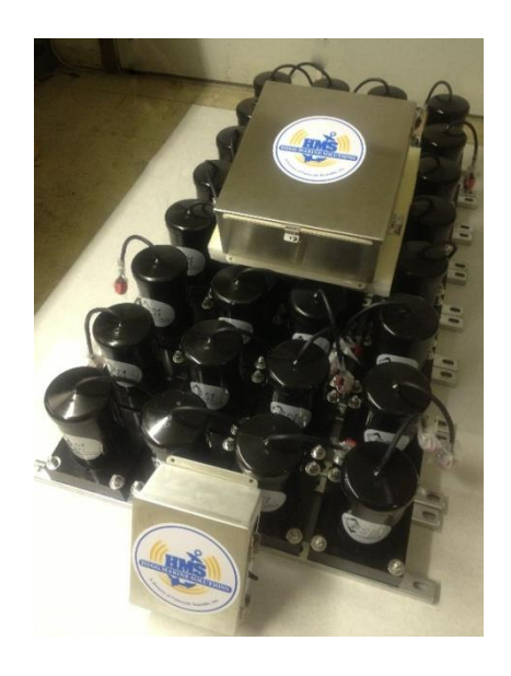
32 Element 12KM LF Array with Preamp and Junction Box