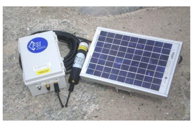
Tide Monitoring System with Optional Solar Charger

Low-power operation and rechargeable batteries allow for long-term unattended operation Surface barometer maintains accuracy with lower maintenance than vented cable systems PUCK v1.3 protocol-compliant for "plug-andwork" ease of system configuration